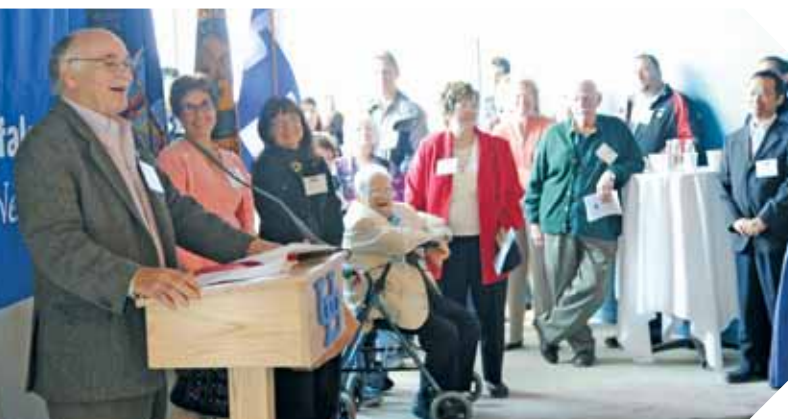
Kapoor Hall Tour