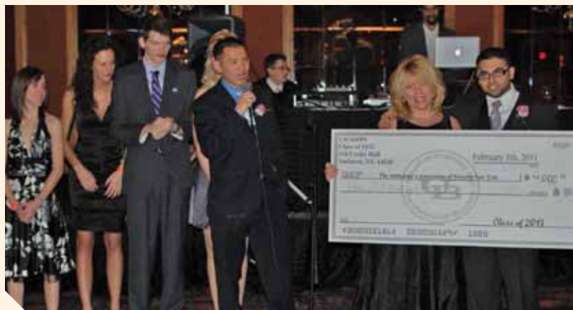
Students Present Check to Alzheimer's Association