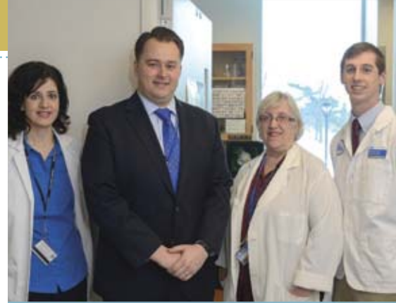
The Research Pharmacy Team

Like Nguyen's hybrid bench work with bio-inspired drug delivery, Daly ultimately is developing a hybrid business-practice model to lead the future of research pharmacy. Currently, the SPPS Research Pharmacy manages approximately 25 studies – and he is focused on increasing that number. Funded now