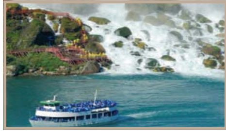
Niagara Falls Maid of the Mist

Buffalo is New York's second largest city, the center of a metropolitan population of about 293,000. It is situated in Western New York State, located at the eastern end of Lake Erie, 12 miles from the world famous Niagara Falls.