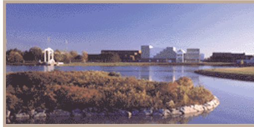
UB North Campus

A flagship institution in the State University of New York system, UB is the largest and most comprehensive campus in the 64-campus SUNY system. It is a member of the Association of American Universities.