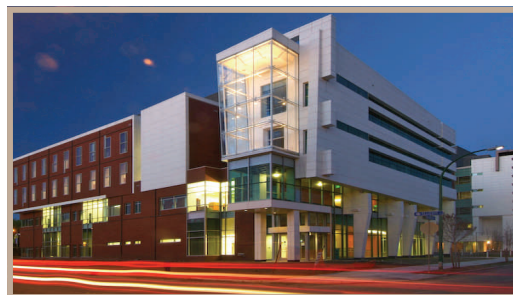
New York State Center of Excellence in Bioinformatics & Life Sciences

UB ranks second among the country's public research universities and 17th among American colleges and universities, in percentage of international enrollment. Nearly 12 percent of UB students study abroad- five times the national average. UB has exchange programs with 70 universities around the world. The School of Pharmacy and Pharmaceutical Sciences is located on the North Campus, in a modern complex that provides ample, pleasant and well-equipped laboratory space and computing facilities for the school's research efforts. Major clinical and research collaboration exists between the faculty of the Schools of Pharmacy and Pharmaceutical Science and Medicine and Biomedical Sciences.